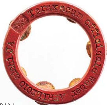
Taraxacum officinale Weber