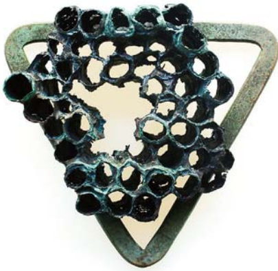
Beehive of collection in 2010