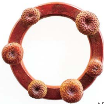
APRIL 2010 AICHI, JAPAN