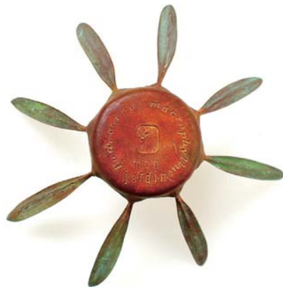
mon jardin podocarpus macrophyllus