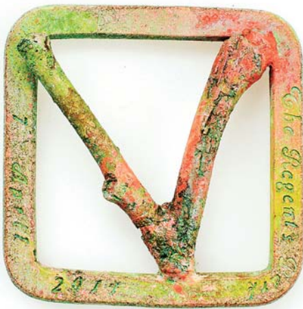
The Regent's Park 7 April 2011

On May 30, 2011, I received e-mail from Teylers Museum. It was information that I had been nominated to Van der Veen /Teylers Prize. Next morning, I found the goldfish in my garden dead.