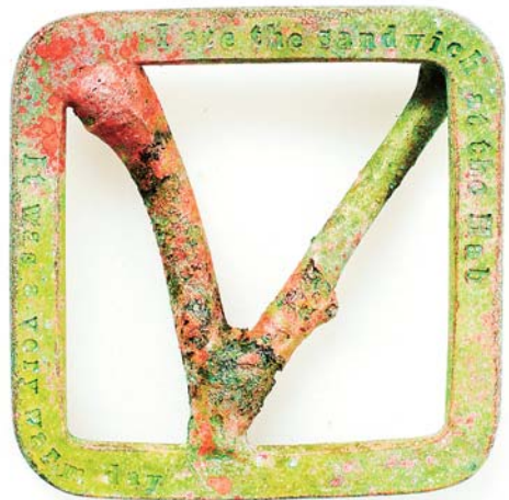
It was a very warm day I ate the sandwich at the Hub