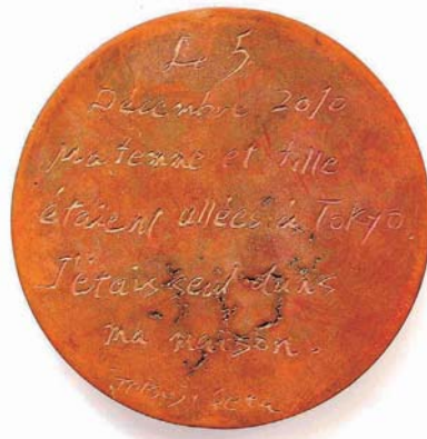
Ma femme et fille étaient allées à Tokyo J'étais seul dans ma maison Le 5 décembre 2010 Tetsuji Seta