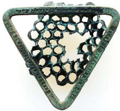
Medal of production in 2011